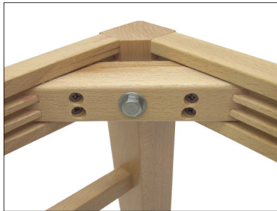
Corner Block System with Center Lag Bolt and Hardened Screws