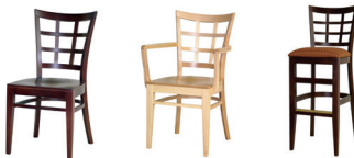
7045 WS 7045-1 WS 7045-2