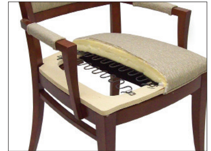
Sinuous Spring Seat

Note: Construction may vary from style to style.